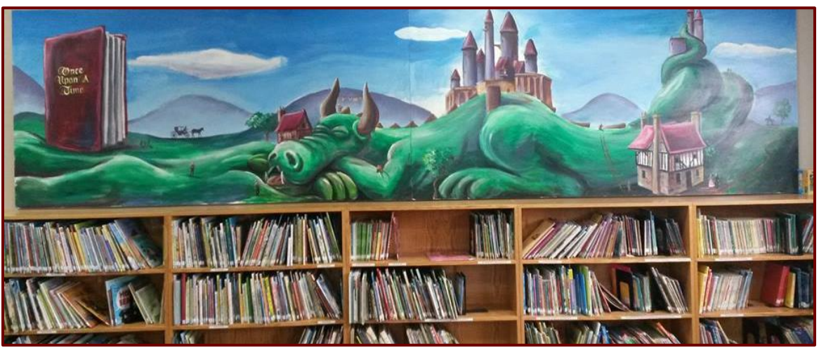
Spring Valley Branch Kids Area