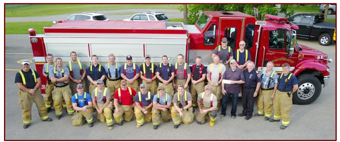
Elizabethtown-Kitley Fire Department Volunteers

The Fire and Emergency Services, also known as the Elizabethtown-Kitley Fire Department (EKFD) is comprised of a dedicated group of volunteers responding to calls from three Fire Stations. Station 1 located at 44 Main Street East Lyn, has staff on hand during the weekdays.