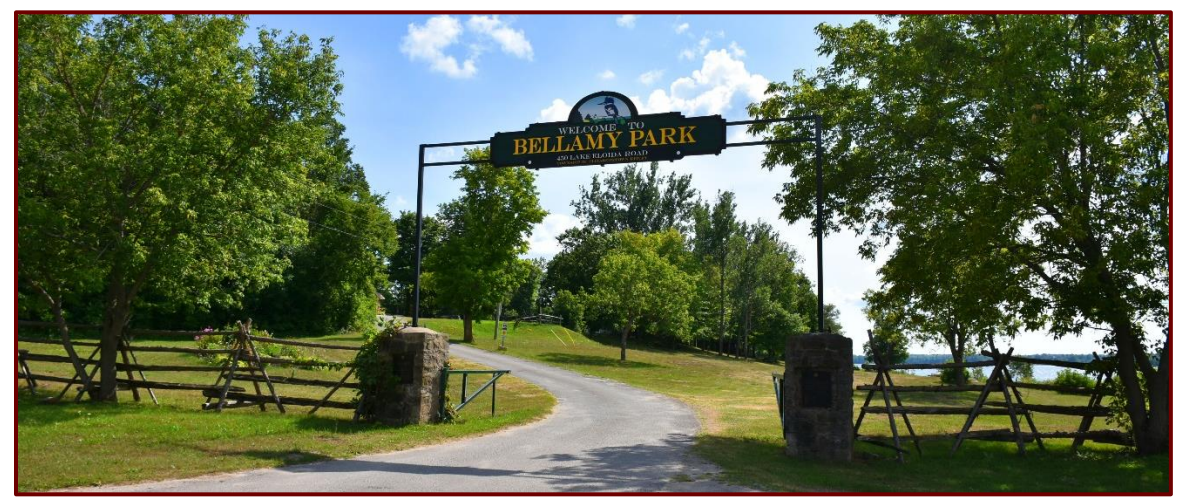
Bellamy Park Campground Entrance

Lyn Valley Conservation, locally as Lyn Pit, is the most popular swimming area for locals. This beach area features a swimming dock, picnic tables, washroom and changing area, and trails. The beach is staffed by lifeguards during most weekdays throughout the summer vacation. Swimming lessons are also provided by the Township for swimmers of all abilities.