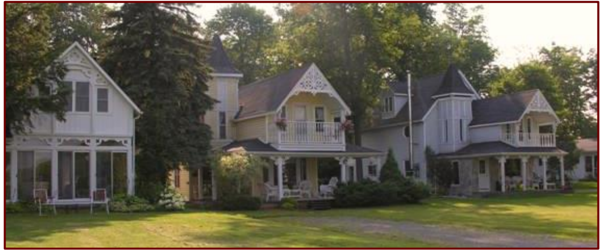
Residences along the St. Lawrence River

If you are interested in dividing your land to create a new lot, or to add or sell land between your property and a neighbouring lot, please contact our Planning and Development staff for an early consultation. The Township's Official Plan outlines policies related to such applications and the Zoning By-law details size provisions for consideration. There are other policies by higher levels of governments that the Township is required to consider as well.