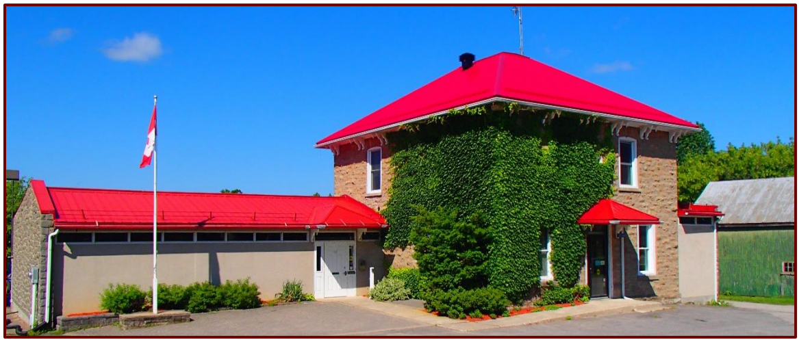
Township New Dublin Office

There are various Committees who focus on specific Township interests. Some of these are comprised of just Council members and are referred to as Committee of the Whole, whereas others are comprised of members of the public with a Council representative. A description of our Committees, their typical meeting schedule, members, and past meeting information can be accessed from <a href="http://www.ektwp.ca/content/committees">http://www.ektwp.ca/content/committees</a>.